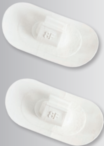
ANCORIS* Tube Anchor Set

ANCORIS* features an innovative clamp and extended-wear adhesive which has been shown to secure nasogastric feeding tubes for an average of 3 days.†